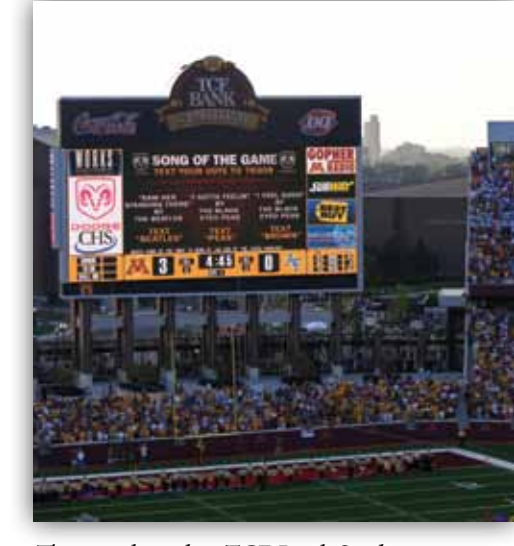
The scoreboard at TCF Bank Stadium was shipped from manufacturer Daktronics in MnDOT District 8.

The research team will compile the findings from this pilot project into a final